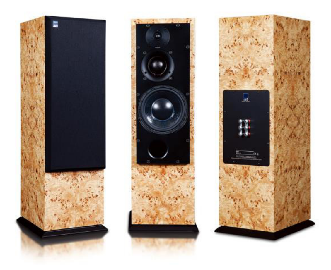
3-Way 3-Speaker Enclosure Bass Reflex Type Units Woofer 23.4cm, Mid-Range 7.5cm, Tweeter 2.5cmRegeneration Frequency Response 40Hz-22kHz (-6dB) Crossover Frequency 380Hz, 3.5kHz Output Sound Pressure Level 85dB / W / m Recommended Amplifier Output 100-1500W Dimensions (WHD) 30.4 × 100.3 × 47cm